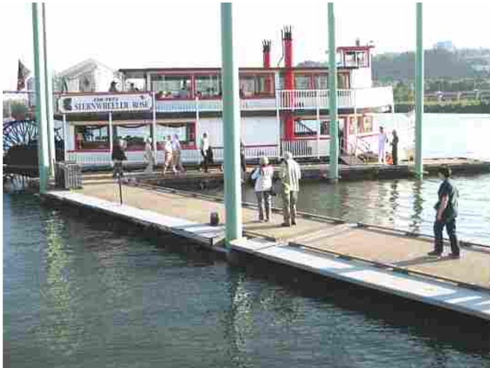
Boarding the riverboat!