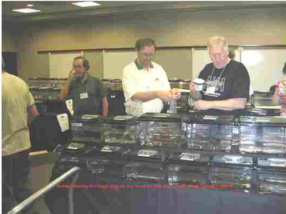
Bagging show fish Sunday morning in preparation for the auction