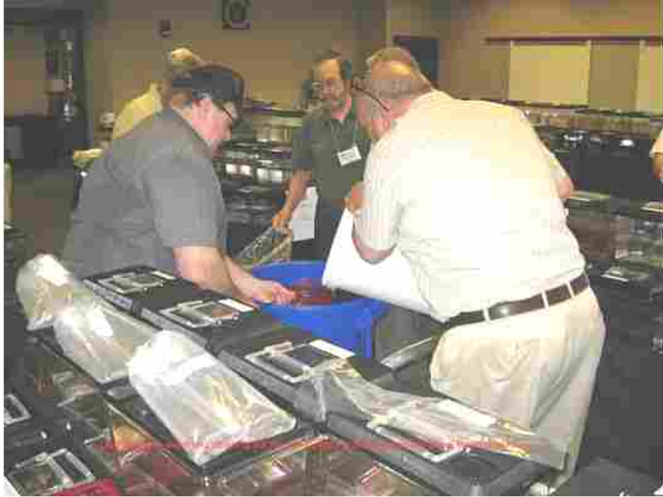
Emptying the show tanks