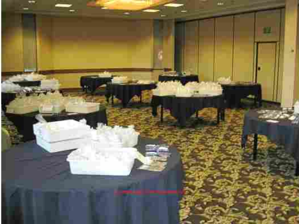
A partial view of the Saturday Fish Sale room