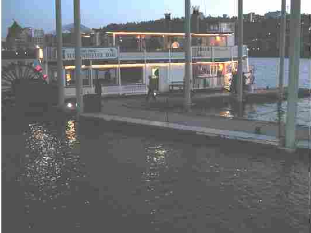
Leaving the riverboat as dusk arrives