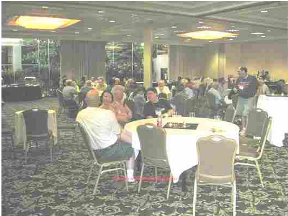
The Friday evening buffet featured a salad bar, pasta bar, and a carving station.