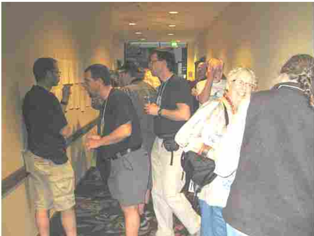
Our three friends from Quebec (dark shirts on the left)!