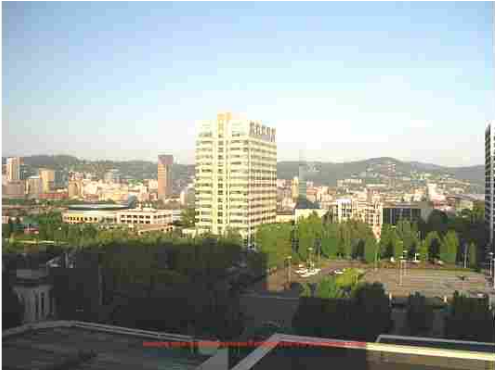
Looking west toward downtown Portland from the 12 th Floor