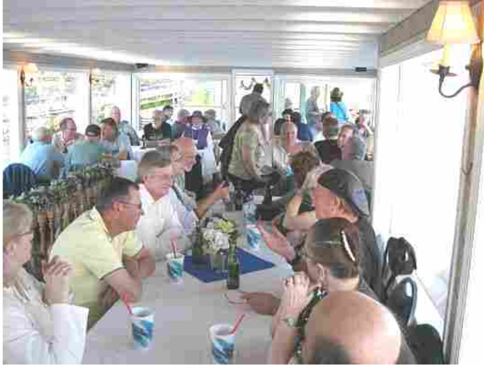
Relaxing topside as the riverboat leaves the dock