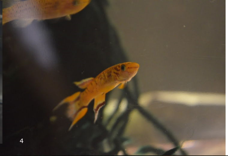
Clockwise from above #3— Jordanella floridae #4 A. australe Orange #5— Hypsolebias magnificus #6— Nothobranchius rachovii #7— Aphyosemion australe Chocolate