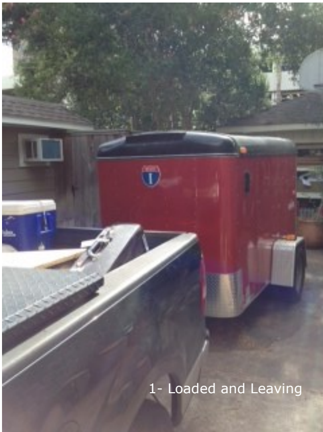
1- Loaded and Leaving